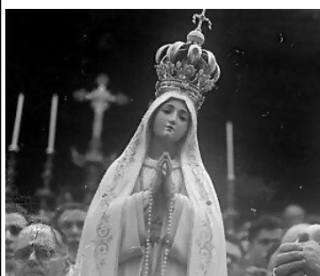
Coronation of the Statue of Our Lady of Fatima, 13 May 1946

6.30am Rosary 7.00am Mass 8.30am Mass 10.00am Mass 5.30pm Rosary 6.00pm Mass - Live Streamed