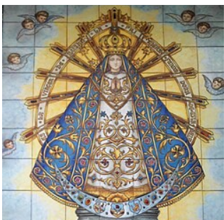
Our Lady of Luján, Mosaic (Seville)

6.30am Rosary 7.00am Mass 8.30am Mass 10.00am Mass 12.00pm Baptisms 5.30pm Rosary 6.00pm Mass - Live Streamed