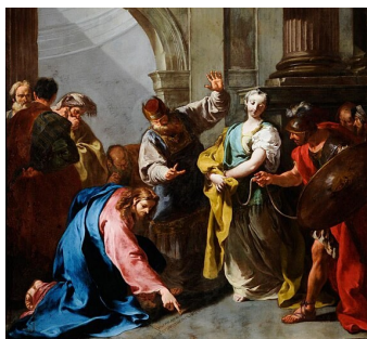
Christ and the Adulteress by Giambattista Pittoni, c. 1730-32. Graves Art Gallery, Sheffield

Dear Parishioners and fellow pilgrims of hope,